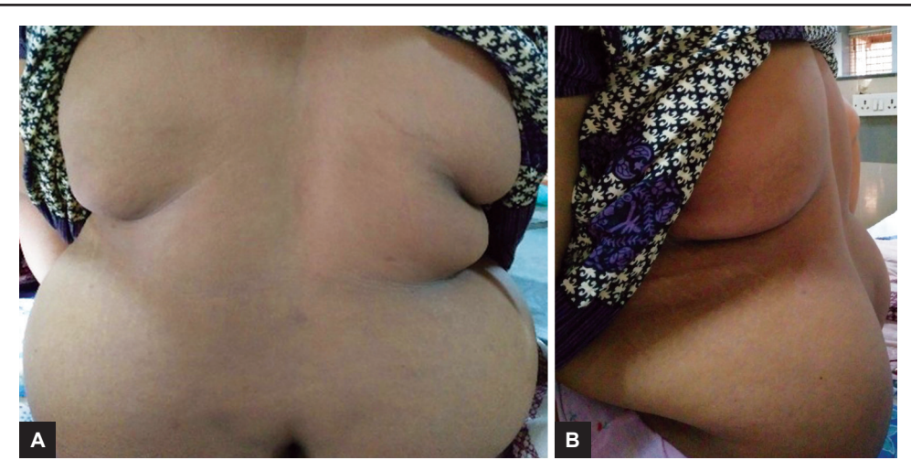
Figs 1A and B: Preanesthetic examination of anticipated difficult anatomical landmarks