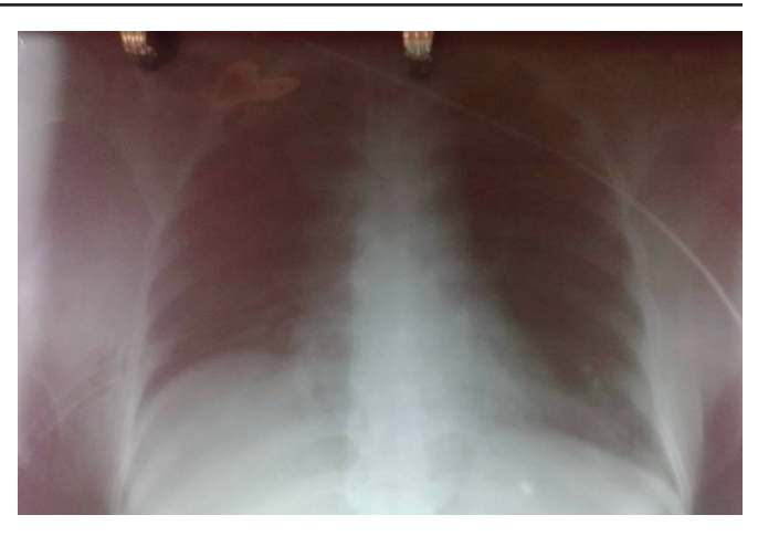
Fig. 2: Post-inter-costal drainage on day 1

Arterial oxygen saturation was maintained throughout. Making use of C-arm and X-ray available in the operation theater, right pneumothorax was identified immediately (Fig. 1). Implantable cardioverter defibrillator was inserted in right 5th intercostal space in midaxillary line. Gush of air was heard. Implantable cardioverter defibrillator was kept in underwater seal. Post-ICD X-ray chest showed significant expansion of the right lung. Surgery was postponed and patient was extubated after 4 hours (Fig. 2).