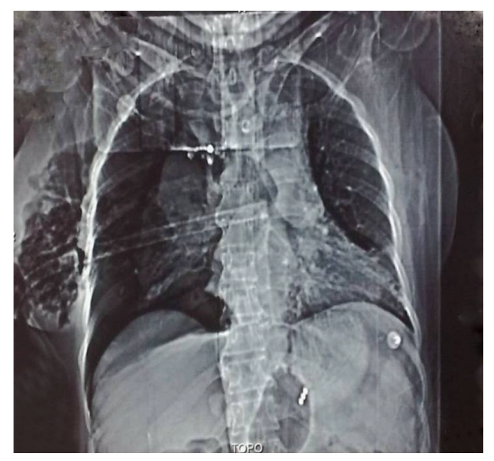
Fig. 3: Right pneumothorax on CT scan day 2

On the 8th day, patient developed tachypnea and desaturation with purulent drainage through ICD and was started on higher antibiotics. The pleural effusion