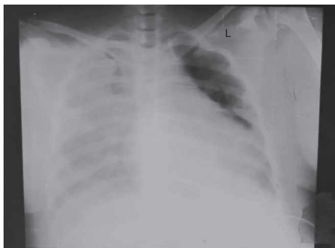
Fig. 1: Chest X-ray shows bilateral consolidation, more on the right side