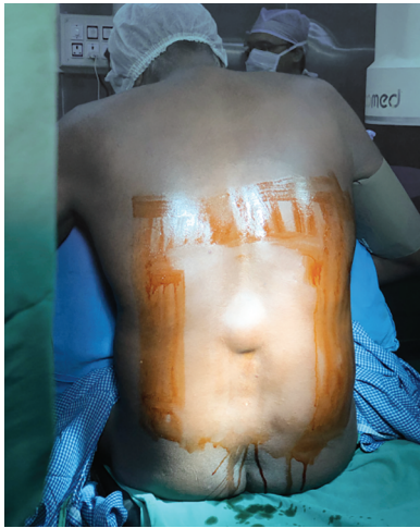
Fig. 1: Lumbar lipoma

requiring a total of two titrated epidural top-ups of 10 mL 0.5% bupivacaine each. Postoperatively, the patient was shifted to surgical ICU where a continuous infusion of 0.125% bupivacaine was given at 5 mL/hour for the next 2 days. The catheter was removed afterward during which it was examined for any damage but did not seem to have any and appeared intact. The postoperative period was uneventful except for a mild exacerbation of COPD which settled with routine nebulizations using salbutamol and budesonide.