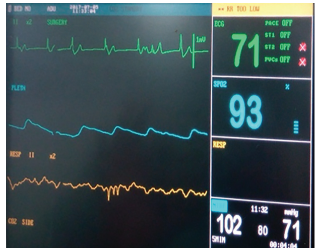
Fig. 2: Intraoperative electrocardiogram with junctional rhythm

around 45 to 50/min, irregular, with bradyarrhythmias and junctional rhythms. Patient was put on inotropic support. Injection dopamine was started @ 15 µg/kg/min and injection adrenaline was started @ 0.1 µg/kg/min. Blood sugar was within normal limits.