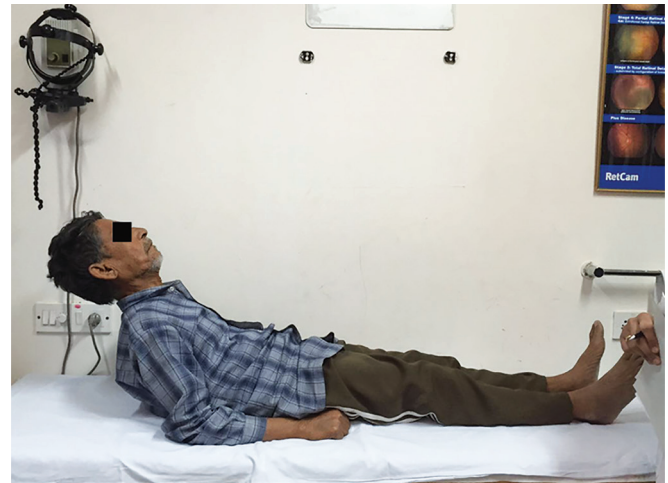
Fig. 2: Patient's inability to lie flat on the operating table

On examination, in the cardiovascular system, prosthetic valve function was normal with audible click and bilateral vesicular breath sound in respiratory system; in the skeletal system, there was a thoracic kyphoscoliosis of nearly 45° (Fig. 1). Intraoperative difficulties anticipated were: Prolonged surgical duration, poor view, and inability to maneuver surgical instruments as well as operating microscope because of patient's inability to lie flat on the operating table (Fig. 2). His cataract surgery had been done under local anesthesia, and he was unable to lie down during the procedure. Only severe Trendelenburg position of the patient would have allowed bringing his eyes in a horizontal position.