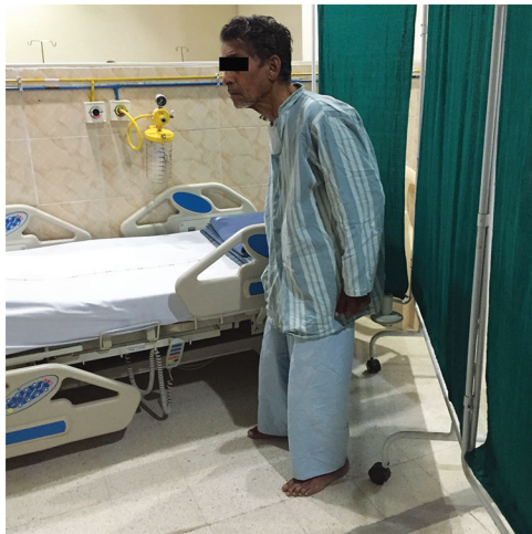
Fig. 1: Thoracic kyphoscoliosis of nearly 45°